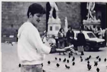
This is for the birds.