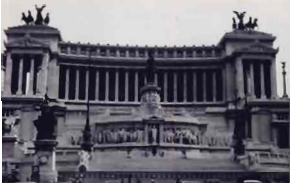
Victoria Embankment in London