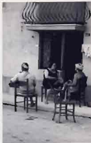
CLOCKWISE STARTING FROM TOP LEFT: SIDEWALK CAFE IN TAICHUNG, TAIWAN. MARKS (DO YOU HEAR WHAT THAT BIG GRAY THING IN THE WAY IS FOR? IS THIS REALLY SURE? AND COOL, IS?