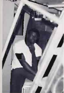
What should I do next?