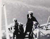
Flight crewmen, back to work