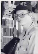
I thought the next take is right at home.