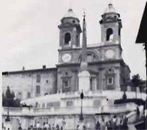
Spanish Steps, Rome, Italy