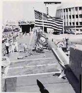
The ship dresses up for Alexandria, Egypt