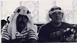
We're thinking of being on with a load of tomorrow