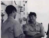
You can argue up with a better way than that, can't you?