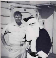
Santa, I sure could use a little (M&M) candy & getting a little work.