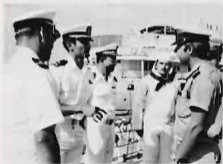
Big: When explains Malton's operations to Egyptian officers