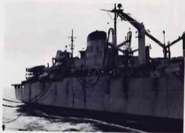
UNREP with the DEPOSIT