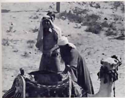
May 1952: How would you like to work?