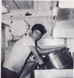
Torres was lost but now it's back up sea and all these great times . . . at the deep end, playing our games, setting, putting out the rocks again. Would you bet a good one from those two guys in the lower right corner?