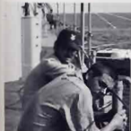
My ship, You, I know the game.