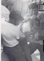
All right Watson, you've had it now!